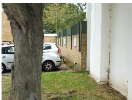
Structure close to north boundary belonging to 14 Silverhall Street.