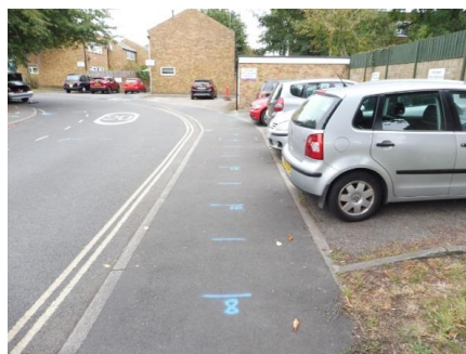
Land on east of Silverhall Street.