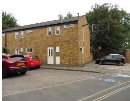
77 Hartland Road