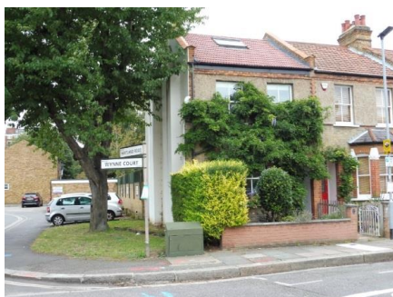
14 Silverhall Street.