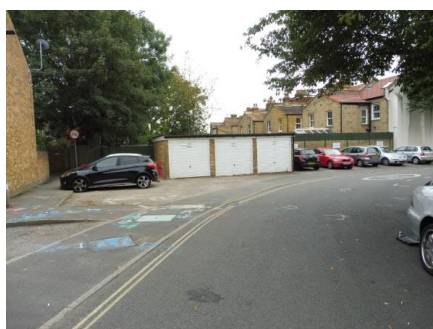
Garage block on the south west side of North Street and the north side of Hartland Road.